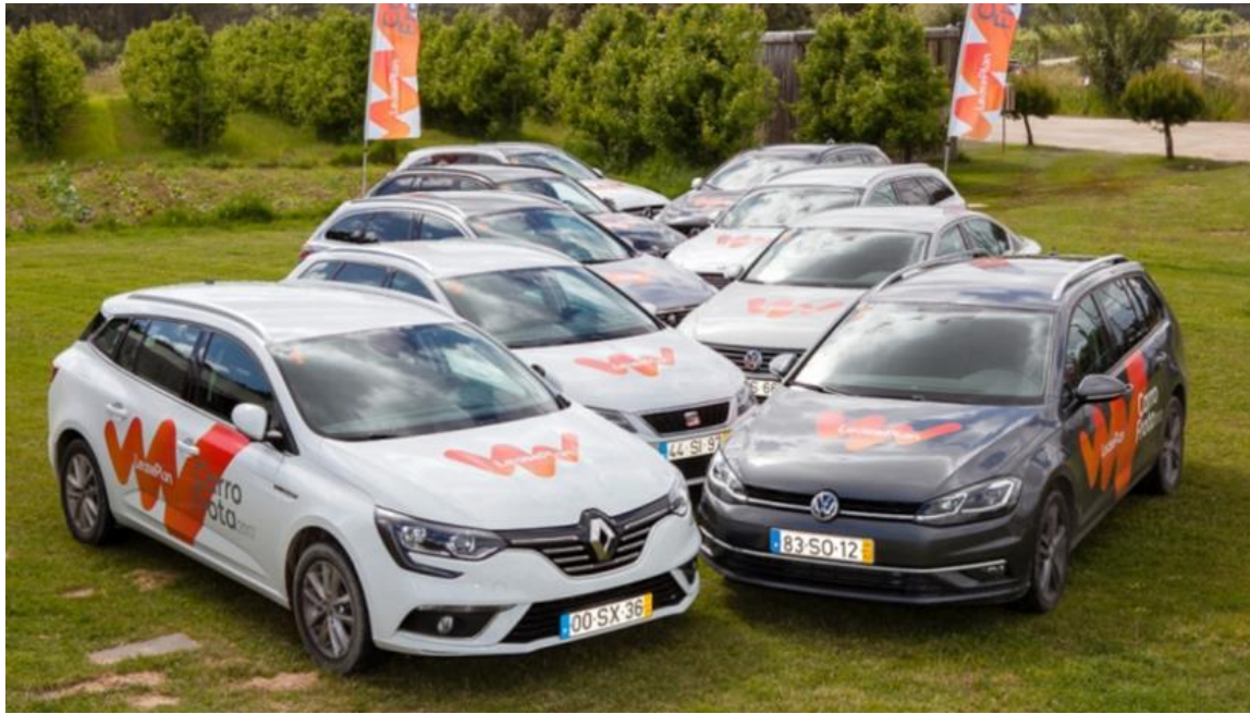
For business reasons (company fleet)