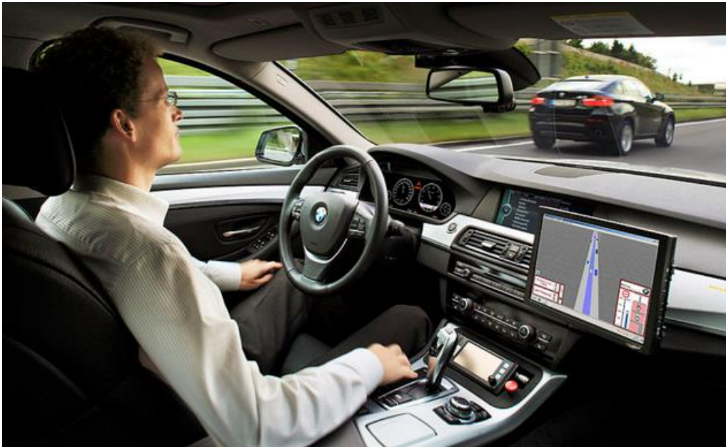
ADAS and autonomous systems