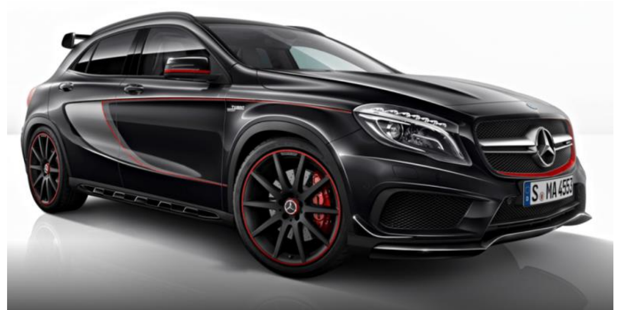
Mercedes GLA 45 AMG (380 hp; 250 km/h)