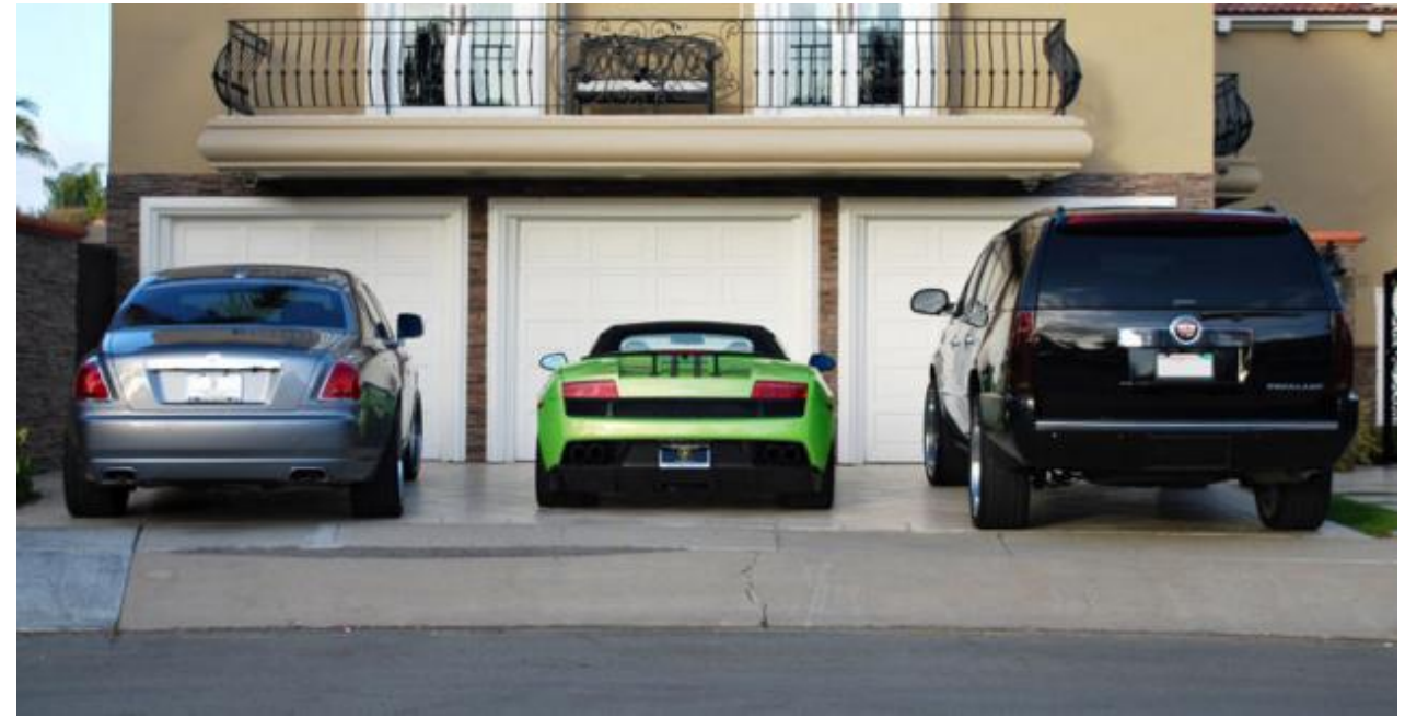
Families have several cars in the garage