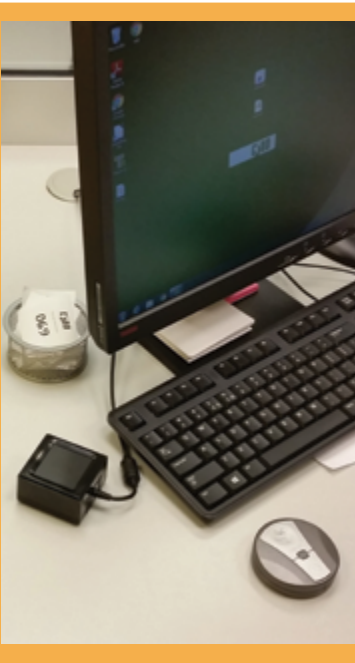
Fingerprint check used in Latvia