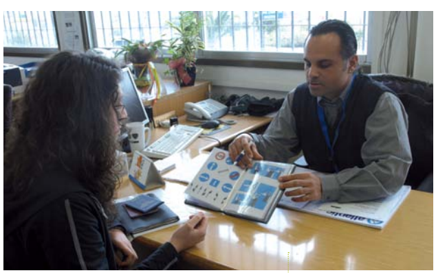
Audit of the driving test in Cyprus