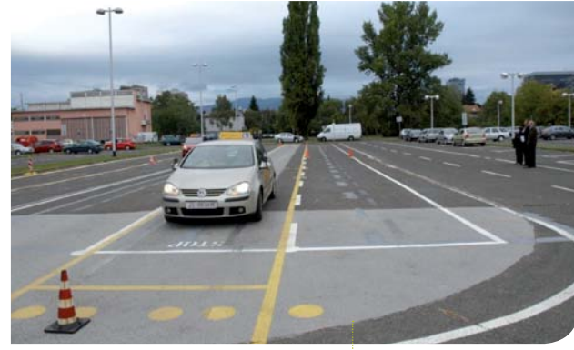
Audit of the driving test in Croati