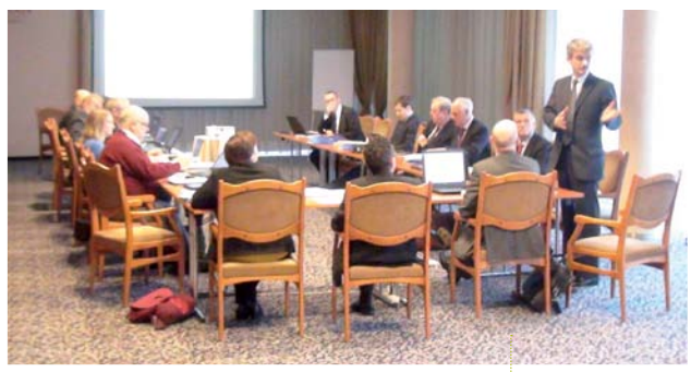
TAG meeting in Lithuania

At the moment, the TAG activities focus on two main areas: the continuous development of the TAG Database which currently holds around 960 items, and the drawing-up of recommendations and best practices. The discussions brought up by the homework completed for the meeting in Vilnius were the origin of the Best Practice document on the Goals of the Theory Test which was one of the main points of discussion during the meeting in Brussels.