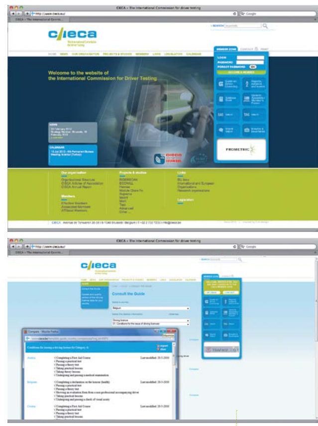
Guide on Driver Licencing