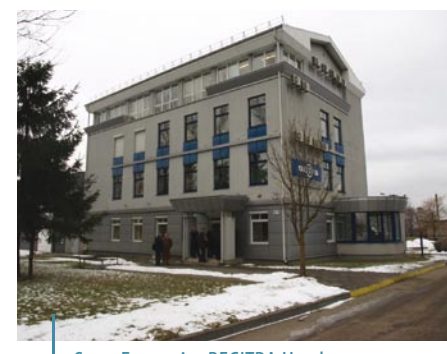
State Enterprise REGITRA Headquarter building, Vilnius, Lithuania