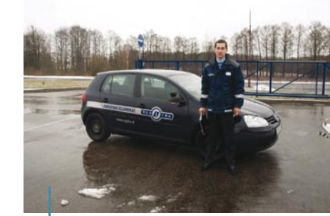
Official test vehicle and examiner REGITRA, Vilnius, Lithuania