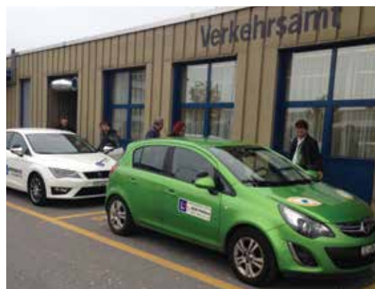
Audits of the tests performed by asa (above) in Pfäffikon, Switzerland, and the SAAQ (below) in Quebec, Canada.

If you are interested in any of the services provided by the EAG, please do not hesitate to contact the group through the CIECA Secretariat.