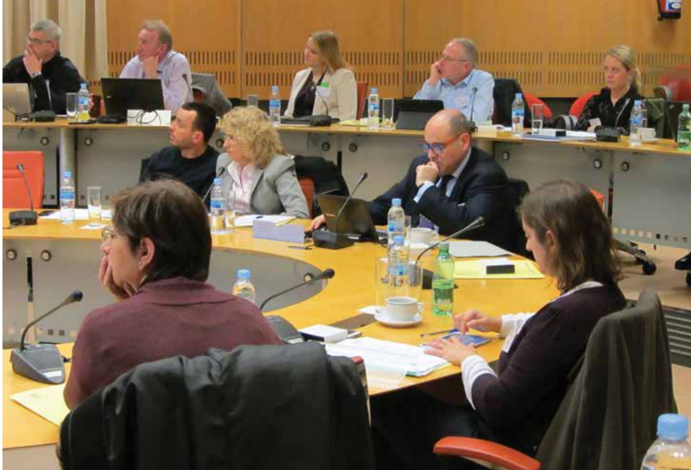
Delegates during the Item Writing workshop held in the DGT headquarters in Madrid.