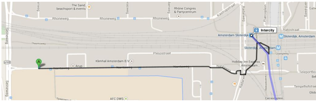
Figure 3: How to get from the workshop location to Station Sloterdijk

You will reach the Station Sloterdijk in ca. 15 minutes on foot (please see the map below). From there you can take either the Sprinter train (Direction Hoofddorp) or the Intercity (Direction Vlissingen). There is a train every 10 minutes (daytime). The journey will take ca. 40 minutes. Train tickets are available at ticket vending machines.